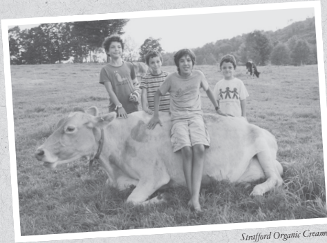
Stratford Organic Creamery

City Market is dedicated to strengthening the local food system. We're grateful to our local farmers who provide our Co-op's Members and customers with nourishing food all year long!